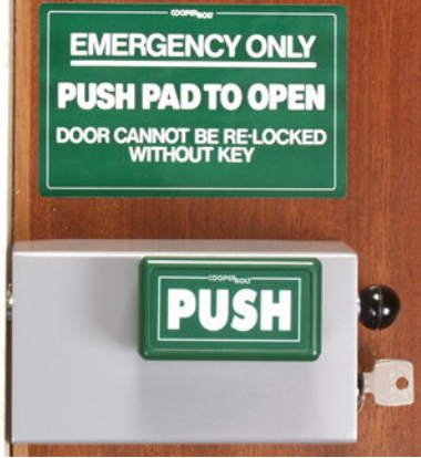
101 - Non-Alarm Bolt