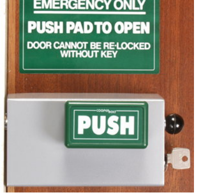
103S Alarm Bolt with Switch