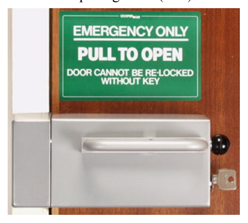
102 - Non-Alarm Bolt